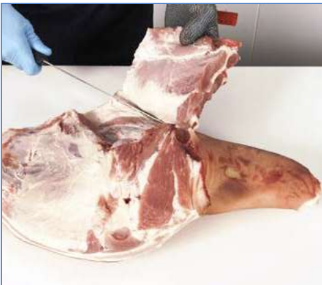
4 ... the underlying brisket muscle.