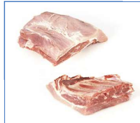
6 Cut between the ribs to create Brisket Ribs.