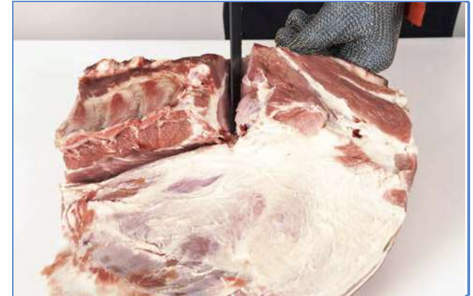
3 ... follow the line of the ribs and cut through ...