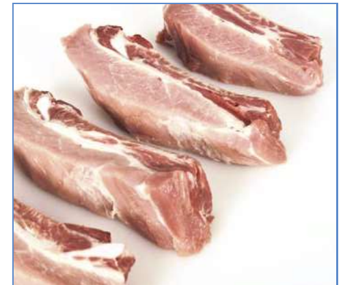
7 Brisket Ribs.