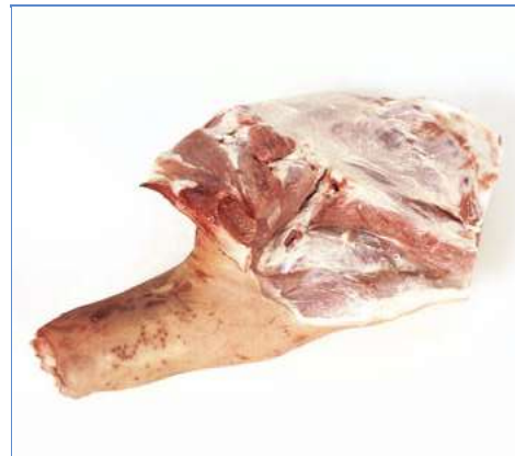
5 Remove the Brisket Rib Rack including the brisket muscle which remains attached to the rib bones.