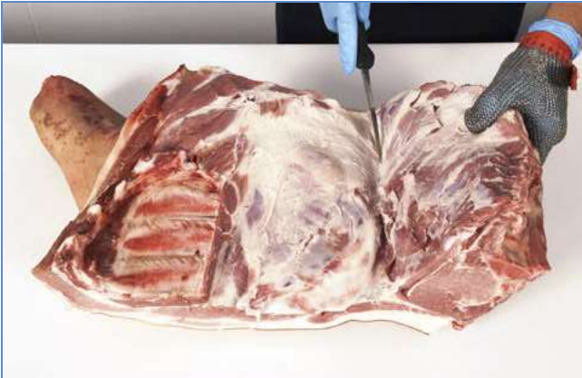
1 Remove the Collar from the forequarter.