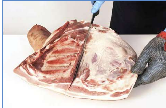
2 To remove the Brisket Rib Rack ...